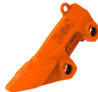
Mechanical side shrouds for side plates 35-90 mm