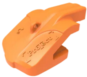
Mechanical lip shrouds for bucket lips 70-140 mm