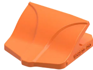
Weld on lip shrouds for bucket lips 40-90 mm